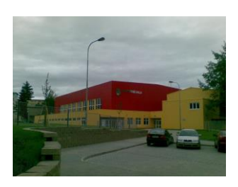
Table Tennis Hall

Žákovská A hall for basketball, volleyball, floorball, futsal and badminton. Capacity of audience – 360 people.